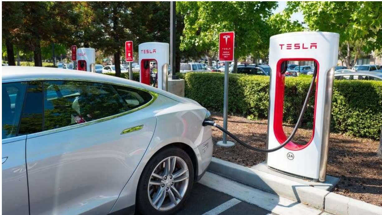
A Tesla electric automobile is photographed plugged in and charging in Mountain View, California.

The EPA's tailpipe regulations, which were unveiled in a joint announcement with the White House in April, will impact car model years 2027 through 2032 and are designed to improve air quality and reduce U.S. greenhouse gas emissions. According to the White House, under the regulations, 67% of new sedan, crossover, SUV and light truck purchases, up to 50% of bus and garbage truck purchases, 35% of short-haul freight tractor purchases, and 25% of long-haul freight tractor purchases could be electric by 2032.