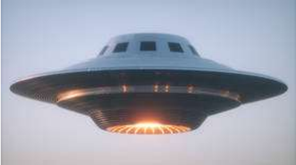
FILE PHOTO: Unidentified flying object, illustration. © Getty Images / KTSDesign / SCIENCEPHOTOLIBRARY

American spies have managed to recover at least nine potentially alien vehicles, two of them “completely intact,” the Daily Mail reported on Tuesday, citing three anonymous sources.