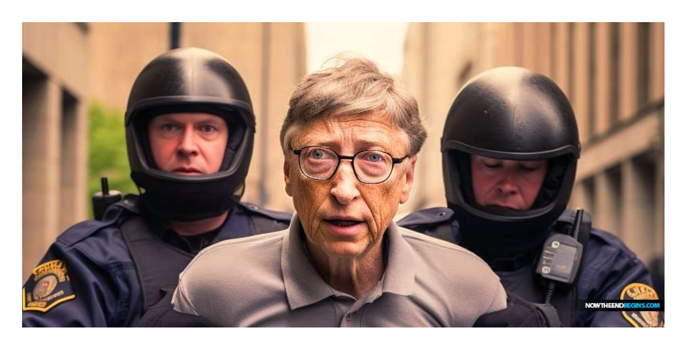
The tech titans have created a world that they own and that they control, not knowing that they are controlled by Satan to carry all this out.

The headlines today have been shocking as for most of the day a majority of cell phone users have been experiencing a total blackout of service for still unexplained reasons. Federal agencies are 'urgently investigating' whether the massive cellular outage that plagued Americans on Thursday was a cyberattack. It brings to mind the dystopian thriller produced by Barack Obama for Netflix called 'Leave The World Behind' about civil war and EMP attacks from the government. One thing is for sure, our global society is controlled by technology and the tech titans to such a degree that everything has become a conspiracy. No one believes anything anymore, and they shouldn't.