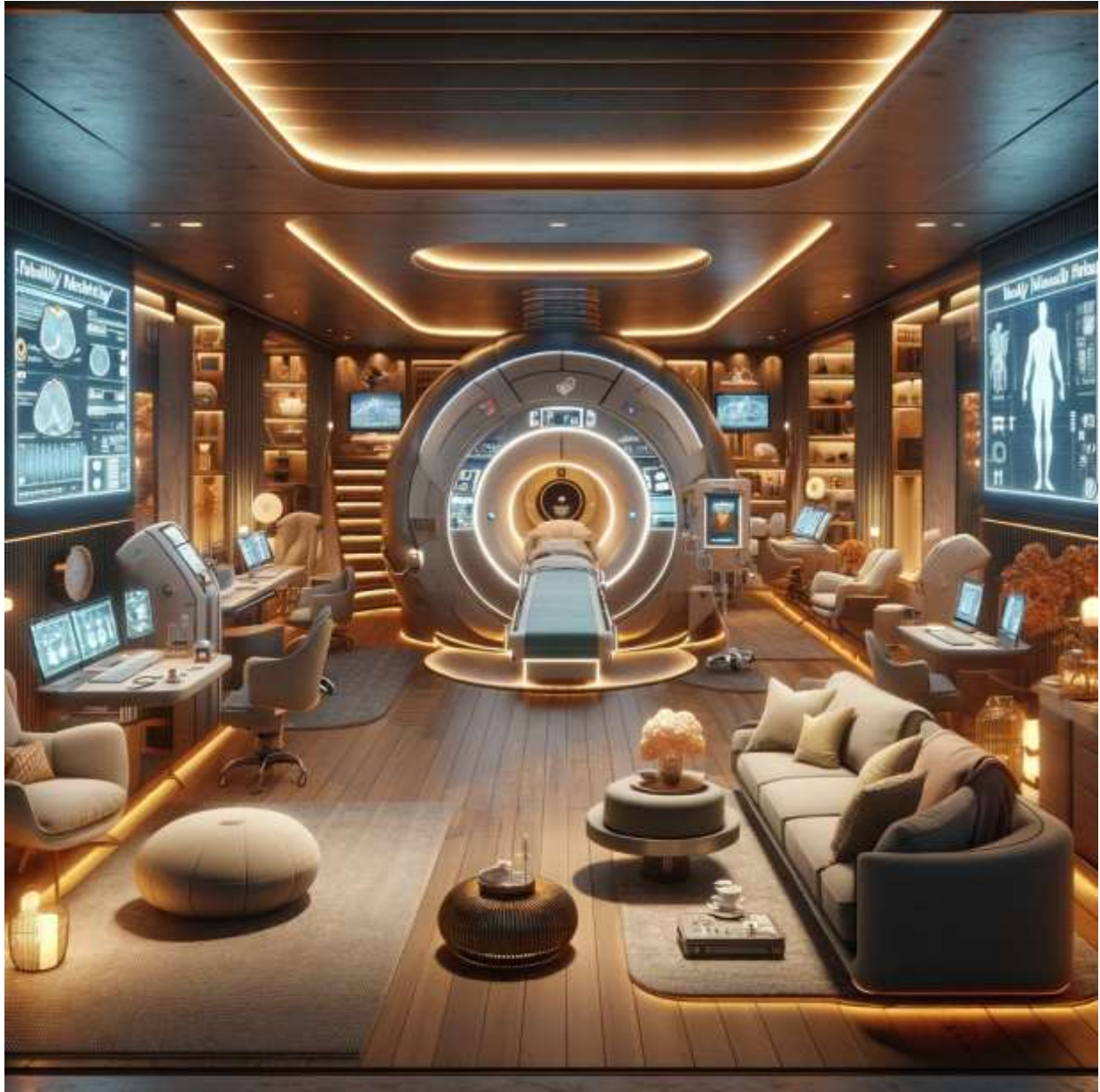
A medical room designed by SAFE. SAFE

swimming pool, so it looks like you are swimming with sharks. And the pool is more like a water park, with a flow river, a lazy river, a grotto and a glass bottom, so you can see a go-cart track underneath the pool. This guy's got all the toys! He has a safe room and we did one secret door that's exclusively for security, but the rest is mostly just for showing off."