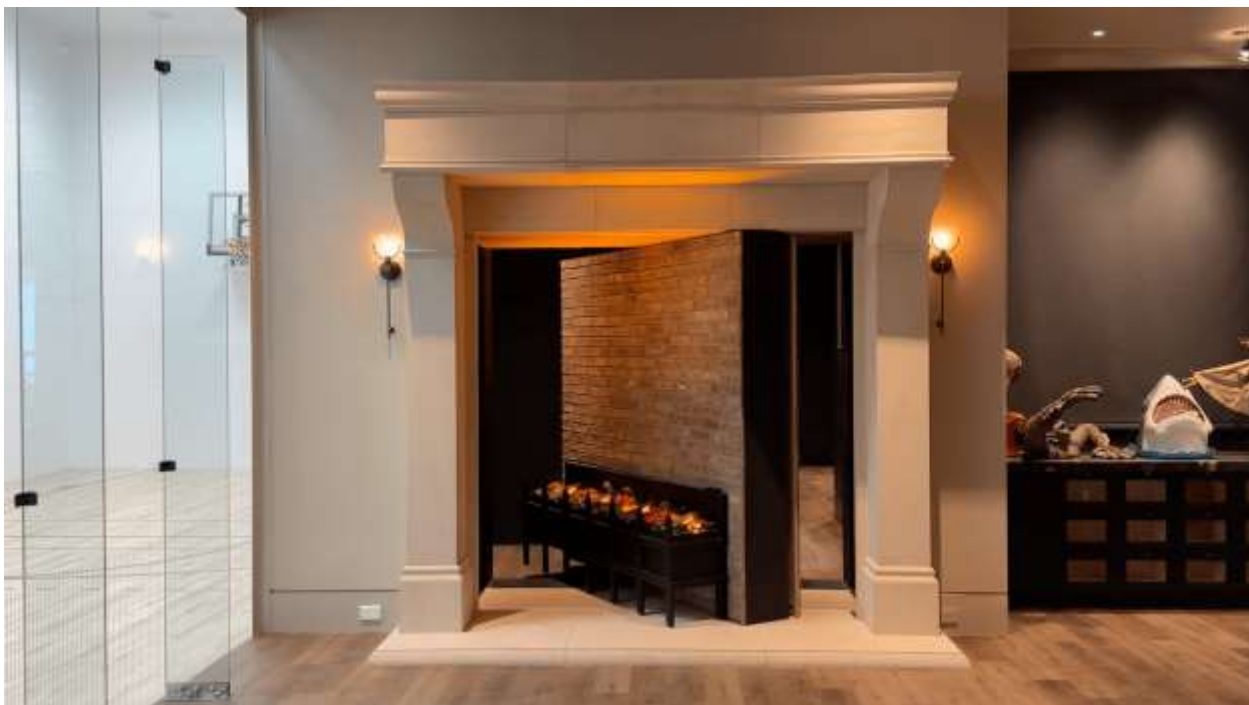
A rotating fireplace leads to an underground bunker, designed by Creative Home Engineering.