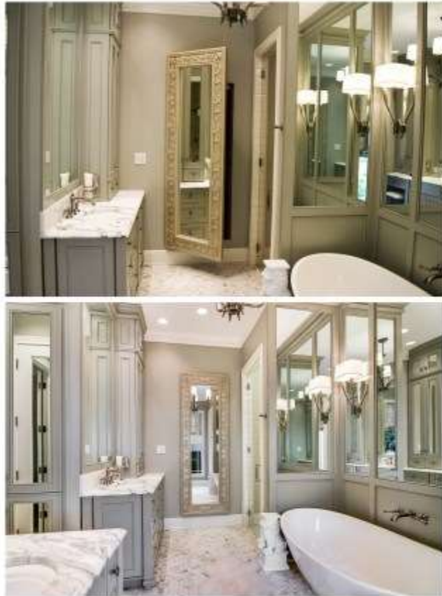
The Vault Mirror Secret Door by Creative Home Engineering.