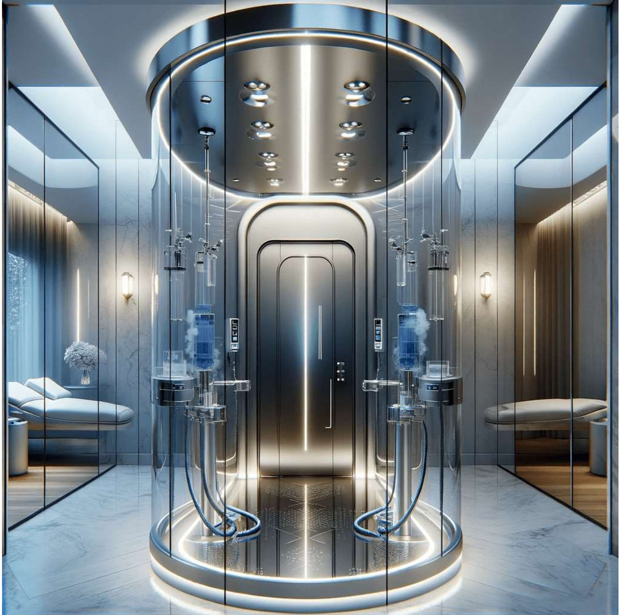
A decontamination room designed by SAFE. SAFE

whole length of it and jump almost a story down into the lawn and run over to the neighbor's house. You would have to have been a rat on adrenaline for that thing to work!"