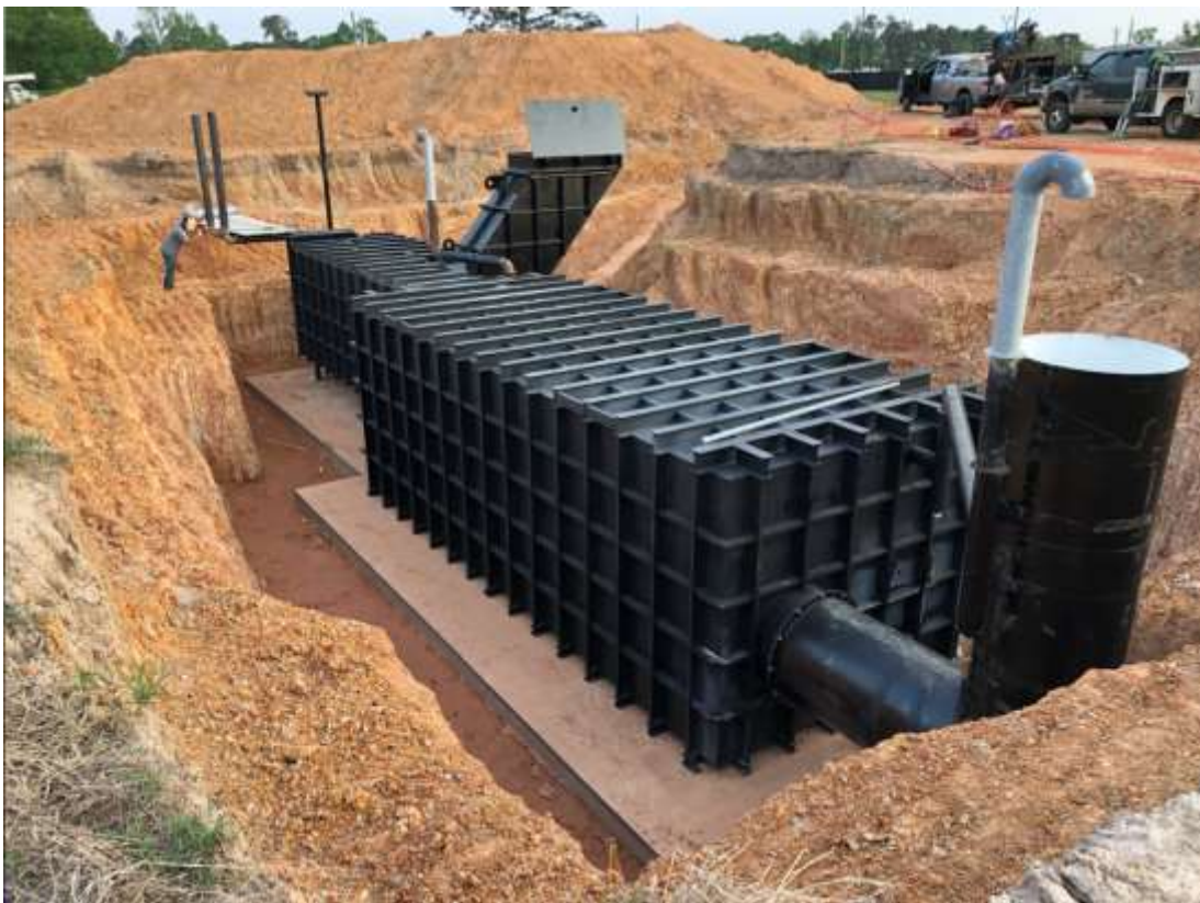
A 400-square-foot Platinum Series modular steel bunker from Atlas Survival Shelters.

Al Corbi, president and founder of Virginia-based SAFE (Strategically Armored & Fortified Environments), which caters to custom designs for the uber-rich, notes that many billionaires are particularly focused on how to survive power grid failures, including buying cars and planes that are less reliant on computer interfaces. "A lot of these guys are buying up King Air or older planes that don't have the electronic avionics, and keeping one or two older cars built before 1986 in their collection, so they'll still function in an EMP [electromagnetic pulse]. The newness is it's shifting from the idea of nuclear ka-boom to protection against local threats. The real threat is the power grid, which is ironically the plot of Leave The World Behind . In situations like this, sustaining your life is as important as food and water."