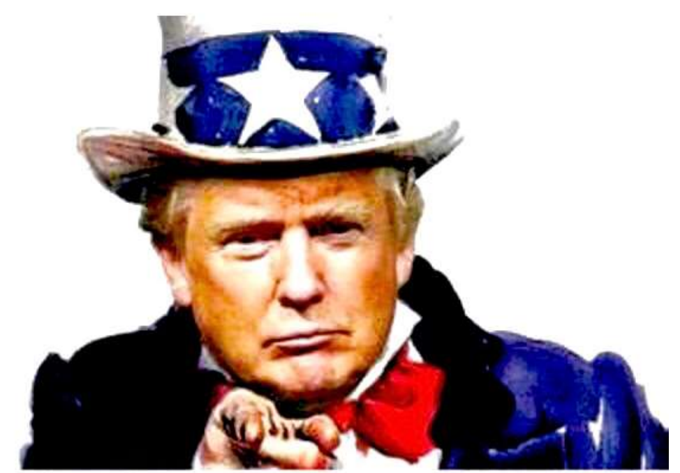
"Everybody go get your shot" Donald Trump

C-certificate O-of V-vaccination I> Identification I-A > Artifical 9-I > intelligence