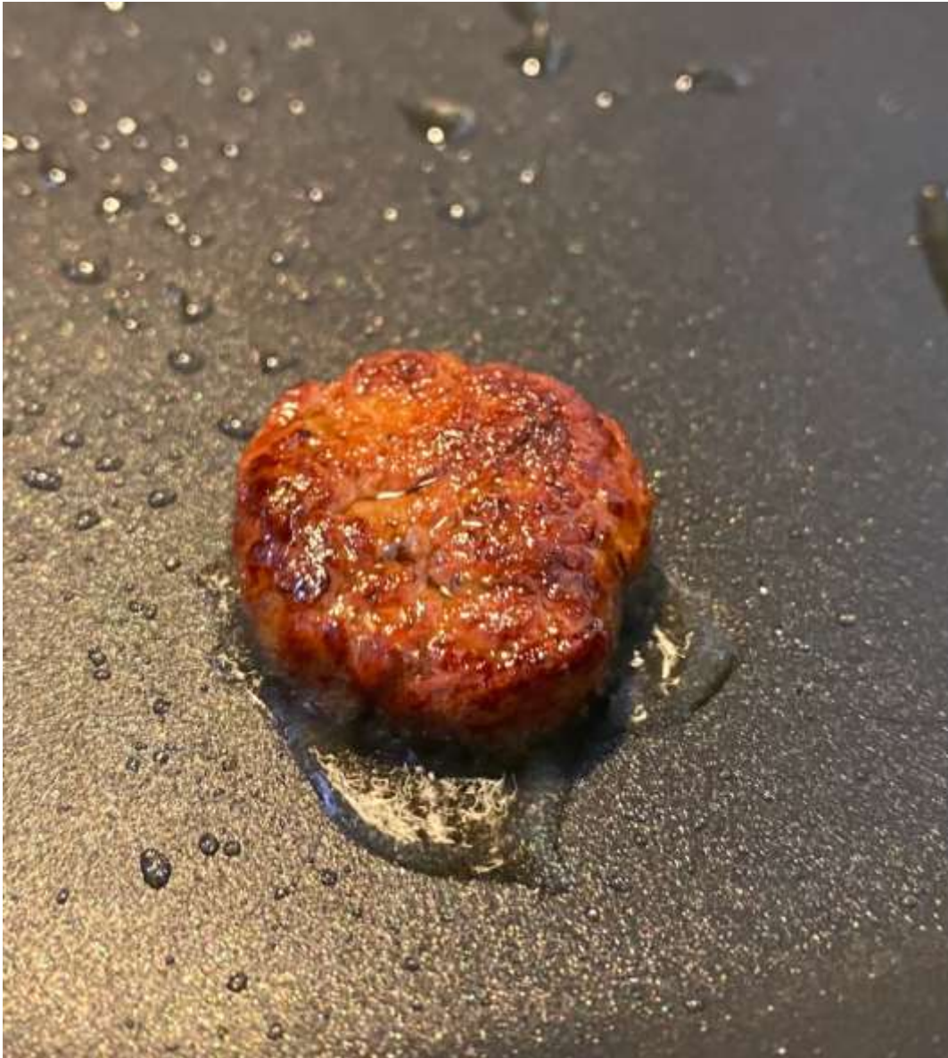
The small koji mold patty after frying.

that's an important angle that we don't need to introduce genes from wildly different species. We're investigating how we can stitch things together and unlock what's already there."