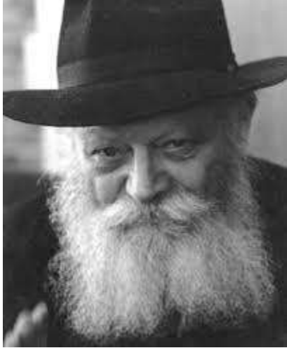
(I. Schneerson in later life.)

According to the 'NY Times', Schneerson "presided over a religious empire that reached from the back streets of Brooklyn to the main streets of Israel and by 1990 was taking in an estimated $100 million a year in contributions."