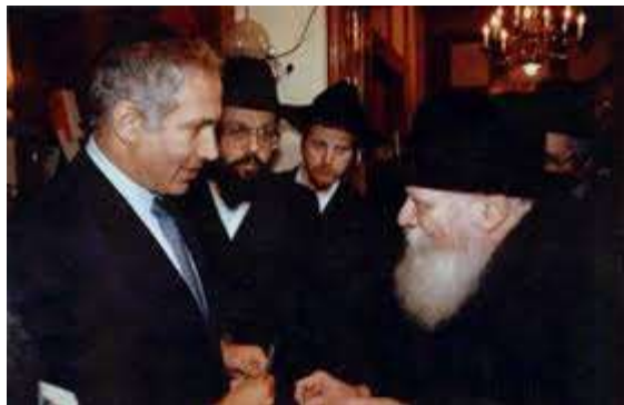
Netanyahu and the Rebbe Schneerson, 1990.

As with the other theocratic juggernauts that move lots of people and money under the cloak of religion, they interlock with the world's consortium of organized crime. There have been many spectacular arrests for such charges as international narcotics, weapons and human trafficking, and of course money laundering. As with the Vatican's international money laundering and pedophile network, nothing sticks.