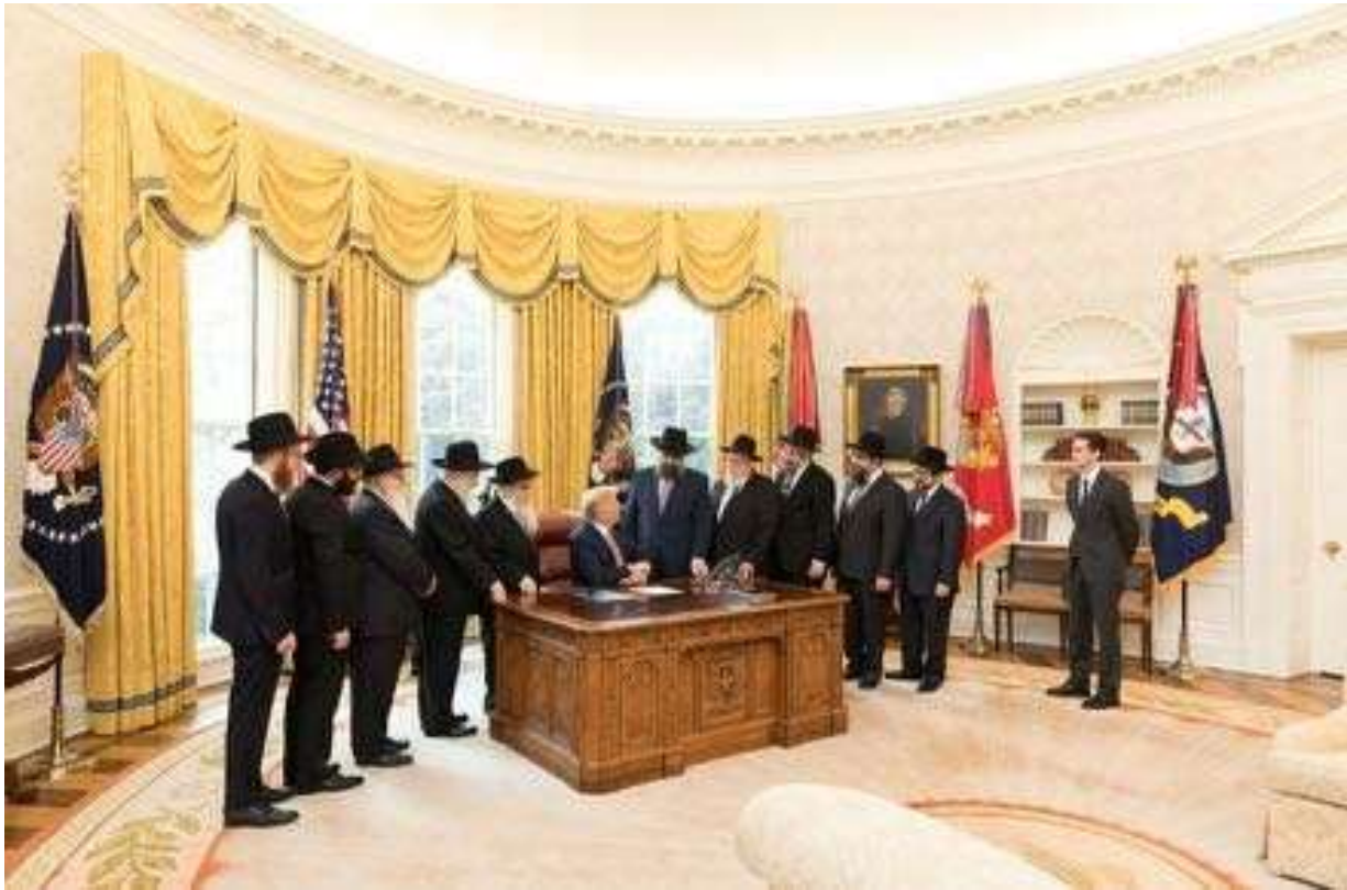
(Trump met with Chabad leaders last Monday March 26) (2017)