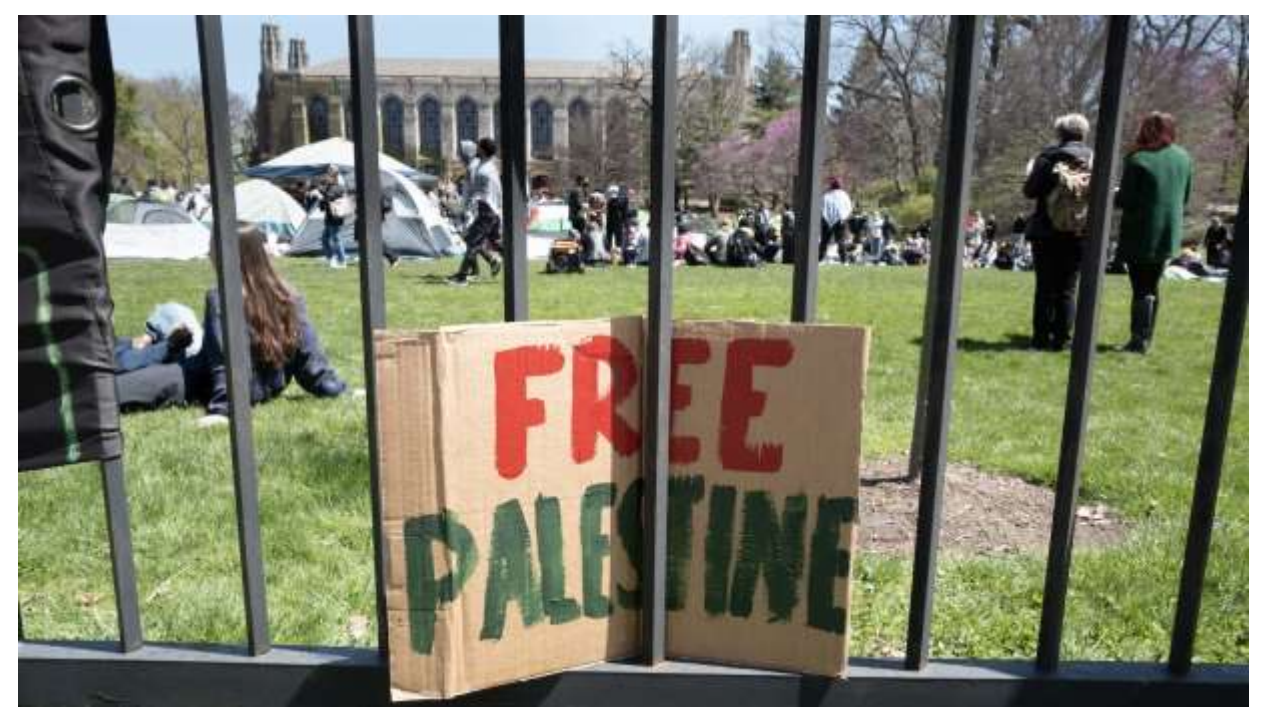
Students gather to show support for the people of Gaza on the campus of Northwestern University

Pro-Palestinian protests are heating up on college campuses across the Chicago area amid a nationwide <u>student-led movement</u> against the war in Gaza. In an article above it has been revealed that the so-called "student-led movement" has been infiltrated by leftist George Soros "activists" with another agenda.