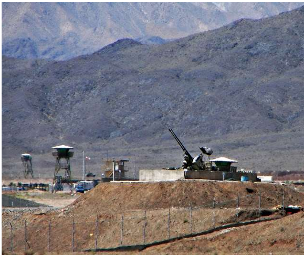
Anti-aircraft guns guarding Natanz nuclear facility,

U.S., Saudi Arabia and Israel are ready for war with Iran and “covert operations” against Tehran have been going on all year but an attack may cause a larger conflict which could usher in the Ezekiel 38 prophecy which bodes not well for the US, Israel, the Saudi's and the UK.