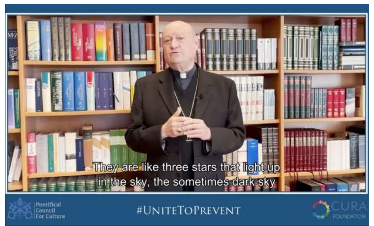
Cardinal. Gianfranco Ravasi inaugurating the health conference

Notably, "50 to 60% of the people who will get infected, get infected from someone with no symptoms," Fauci maintained, ignoring more recent <u>studies</u> damning face masks as not just ineffective against COVID-19, but as dirty, dangerous and dehumanizing.