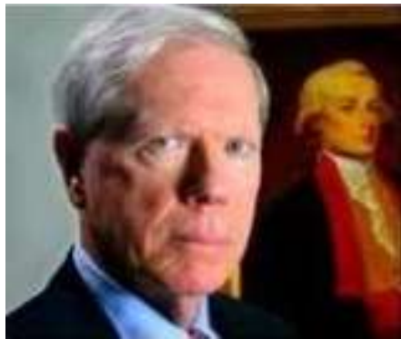
By: Paul Craig Roberts

Paul Craig Roberts, a former Reagan administration cabinet member has stated: “Medical Information Is Being Suppressed To Cover Up For The False Covid Narrative” This is for the skeptics who believe Covid was a novel rogue virus from bats and pangolin in China.