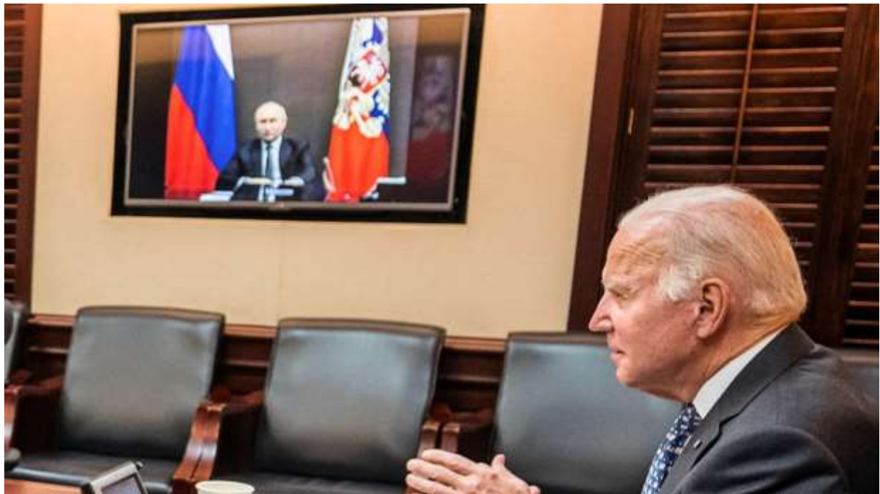
Biden talks Russia's 'invasion' of Ukraine

The Russians would willingly give up on Europe almost entirely, even including the Baltic States to get back the parts of the Ukraine that are an inalienable chunk of their society. That should suit Washington quite well. That's not Joe Biden in the photo below!