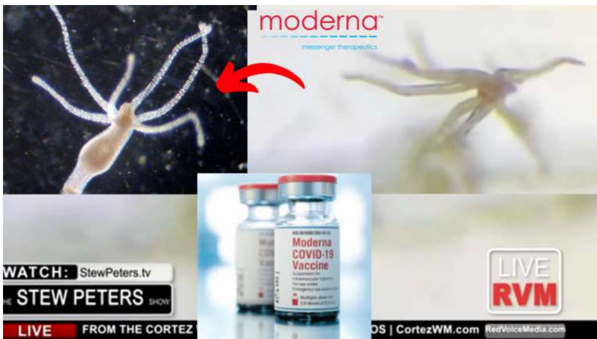
Hydra Vulgaris identified in Pfizer & Moderna Covid-19 serums