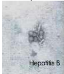
image title already says, an agglutinate. This is the scientific/medical term for proteins from the blood that are clumped together, as is typical for coagulations. Typically, thereby round and also crystal structures accrue - depending on the condition of the blood sample.

5. The photo of the hepatitis B "viruses" does not show isolated structures, but - as the