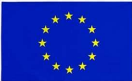
Upper left: Original 1923 flag for the Pan-European Union designed by Coudenhove-Kalergi which featured the Templar cross. At top right: a modified update of the Pan European flag (date unknown) and bottom left: The final version of the design as seen on today's European Union

Among the large array of early supporters of Coudenhove-Kalergi’s Pan Europa included the likes of Benito Mussolini, Winston Churchill, Walter Lippmann, Nazi finance minister Hjalmar Schacht, and Nazi geopolitician Karl Haushofer, while financiers Max Warburg and Louis de Rothschild bankrolled the organization.