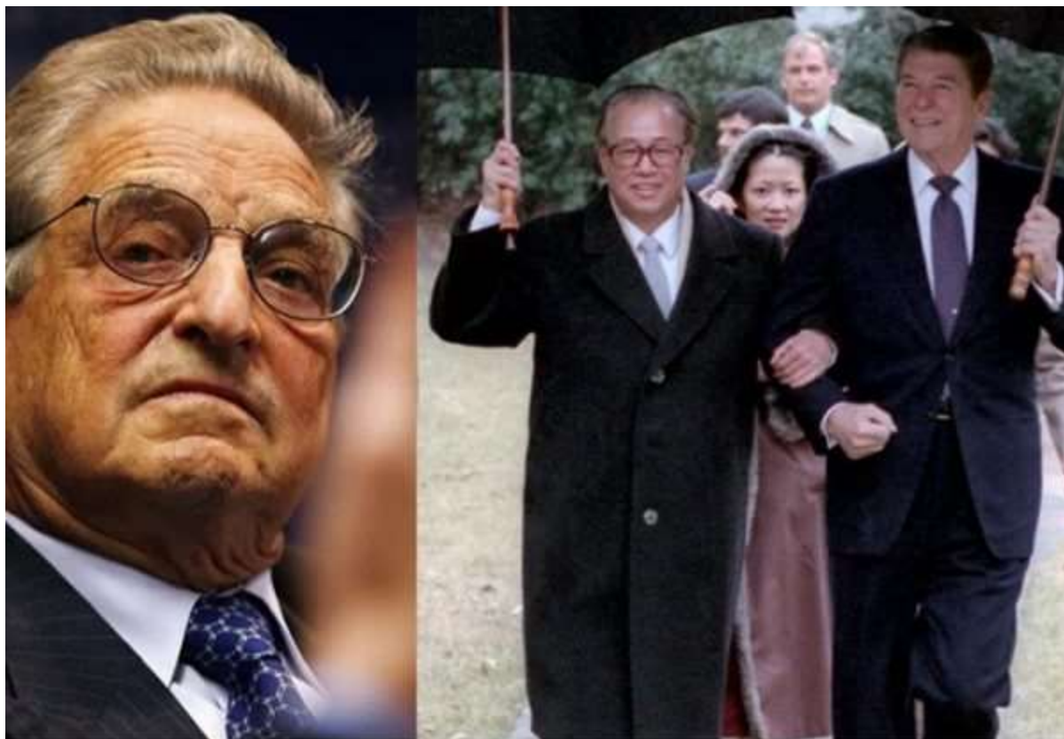
Soros (left) and his puppet Zhao Ziyang (Secretary General of the Chinese Communist Party) walking with Ronald Reagan in 1988

Guo's luck ran out in 2014 when he found himself facing dozens of charges of bribery, extortion, blackmail, and rape. Guo's inevitable prosecution was fueled by a much larger crackdown of China's deep state led by Xi Jinping's anti-corruption campaign.