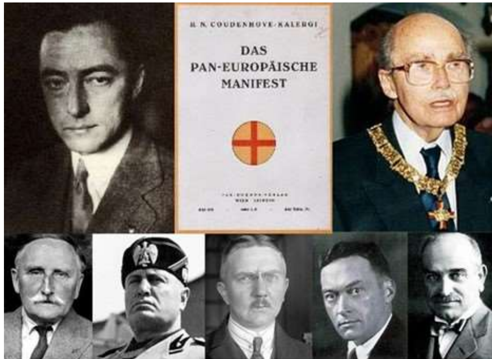
The Pan European Movement held strange ties to the "liberal revolutionaries" of the Austrian School's Mont Pelerin Society: Top row: Count Richard Coudenhove-Kalergi and his 1923 Manifesto, Archduke Otto von Hapsburg, Bottom row: Nazi geopolitician Karl Haushofer, Mussolini, Hjalmar Schacht, Walter Lippmann, and financier Max Warburg

As is too often the case with such false dualisms, the spread of Bolshevism was itself funded by the same oligarchical agencies which simultaneously bankrolled the conservative reactionaries of Pan Europa, who were disgusted by the destruction of traditional values and norms carried out by the Bolshevik radicals.