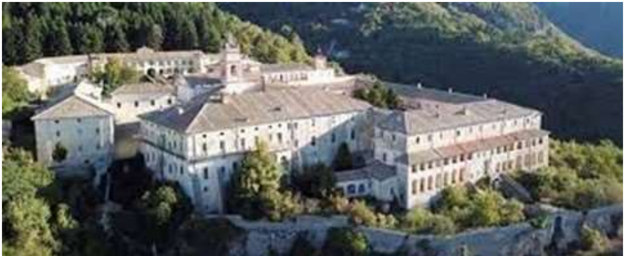
The Tristuli Monastery and headquarters of the Dignitatis Humanae Institute

It is here that we start getting a fuller picture of the nature of the false 'left vs right' game being played , as we look at a City of London-based think tank which Bannon leads called the Dignitatis Humanae Institute located within an 800 year old monastery called the Abbey of Tristuli. This Abbey was constructed on the orders of Pope Innocent III in 1204 to celebrate the fourth Crusade which saw the strategically important sacking of Constantinople by hoards of Christian crusading mercenaries killing fellow Christians. The Abbey is located in Ireland.