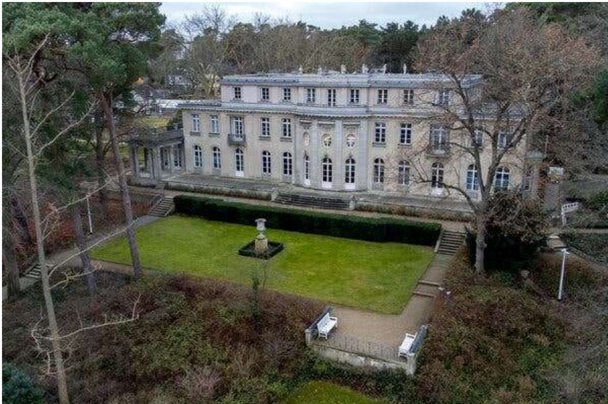
The Wannsee villa, where Nazi officials planned the Holocaust in 1942.

Until the 1980s, the villa was a youth hostel for school trips. Only after reunification, in 1992 did it open as a memorial.