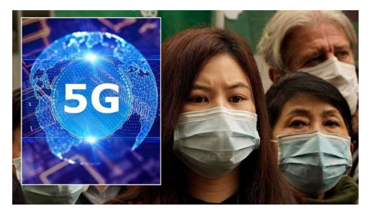
5G + Coronavirus + Vaccinations + Chemtrails = Depopulation Event

Let's face it: it didn't take a rocket scientist to figure out that the very day 5G was activated in Wuhan alongside a recently release virulent flu strain targeting racially susceptible individuals, that people would start dropping like flies. Such an assault on the immune system is guaranteed to take out a big number of city dwellers in a day and a night. And drop on the spot they have done, perhaps many more than the world will ever know.