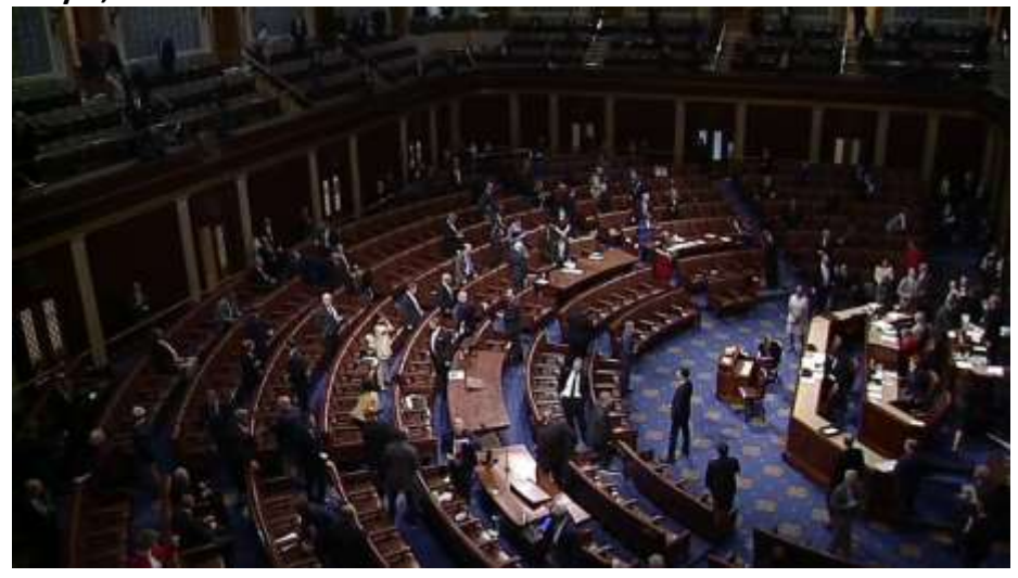
Ed Hendrie -- Congress Passed Relief Bill Before Pandemic Started May 6, 2020

"How could the U.S. Congress know that there would be a need for such legislation to address an illness that had not even been reported to have occurred in the United States?"