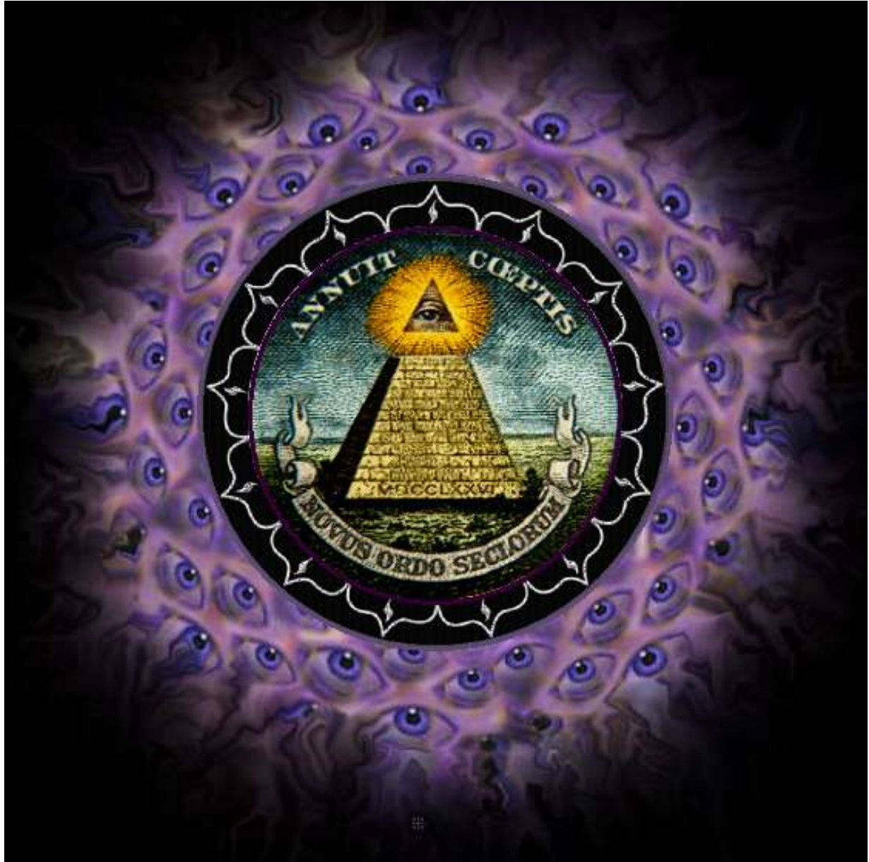
Novus ordo seclorum = “New Order of the Ages”

As the source article above indicates, it's now critical to comprehend at this pivotal point of the wholly manufactured pandemic that 4G also plays a central role in triggering the COVID-19 disease process. The rapid spread of COVID-19 across the USA, particularly in rural areas with no 5G but which have had 4G networks in place for years, graphically illustrates this stark reality. This particular data point reflects that an ongoing test is being conducted by the ruling technocracy to swiftly determine the extent to which the supporting 4G weapon subsystem is effective in creating a conducive environment for bio-weapons like COVID-19 to inflict damage to the wireless IT-bound populace, especially smartphone users.