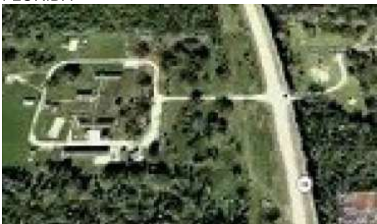
Avon Park – Air Force gunnery range, Avon Park has an on-base "correctional facility" which was a former WWII detention camp.

Camp Krome – DoJ detention/interrogation center, Rex 84 facility Eglin AFB – This base is over 30 miles long, from Pensacola to Hwy 331 in De Funiak Springs. High capacity facility, presently manned and populated with some prisoners.