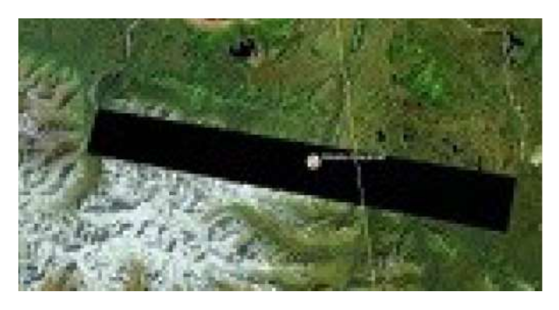
Wilderness - East of Anchorage. No roads, Air & Railroad access only.

Estimated capacity of 500,000 Elmendorf AFB – Northeast area of Anchorage – far end of base. Garden Plot facility.