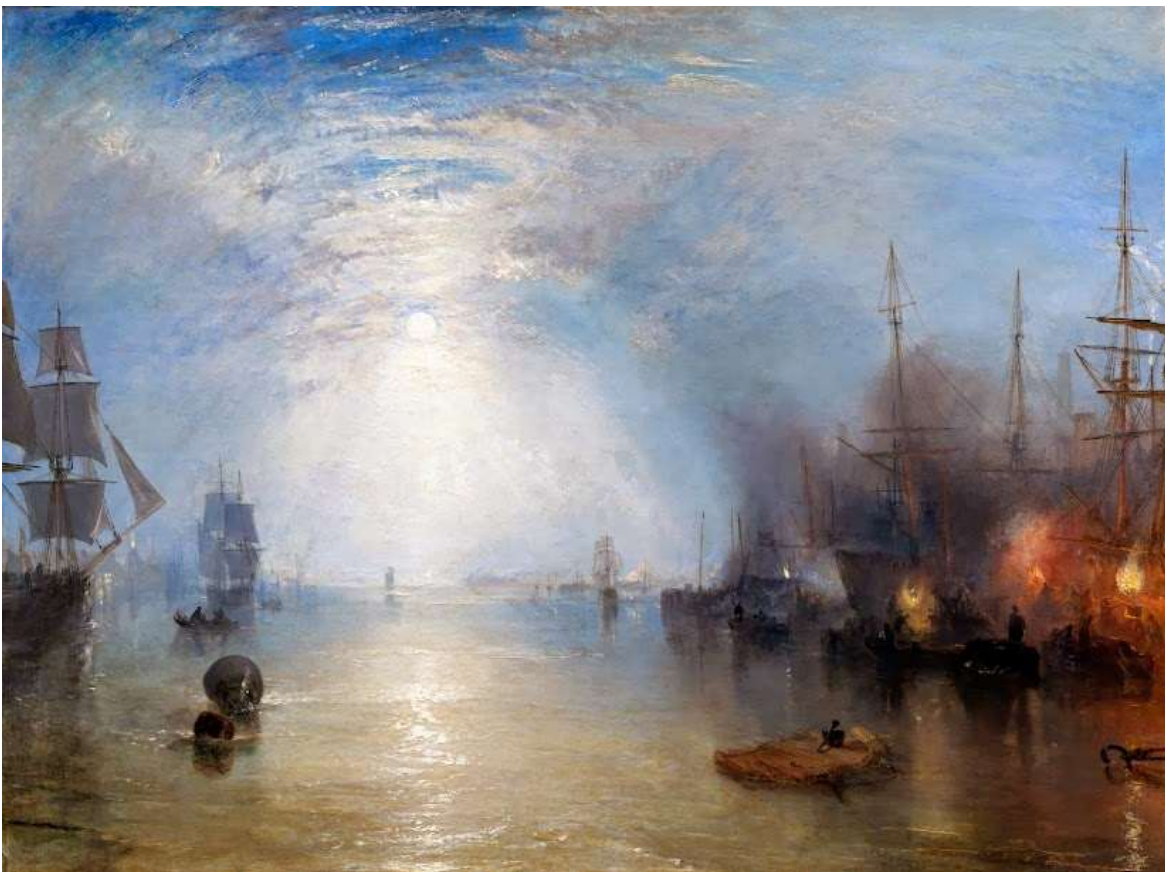
J.M.W. Turner, Keelmen Heaving in Coals by Moonlight, 1835, National Gallery of Art, Washington, D.C.

Oscar Wilde once said “ Life imitates art far more than art imitates Life. ” What did Oscar Wilde mean when he wrote that “ life imitates art far more than art imitates life ”? Simply put, this quote from The Decay of Lying (1891) is about how art affects the way we look at the world around us. Take fog, for instance: One of Wilde’s ideas is that we appreciate the beauty of fog in nature today because painters, such as Turner, revealed that beauty.